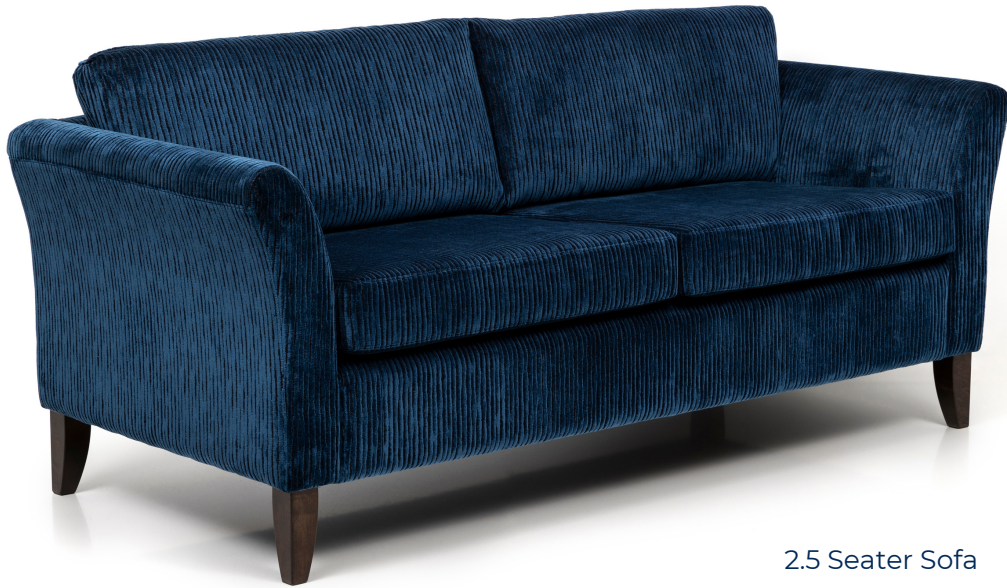
2.5 Seater Sofa